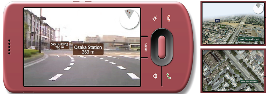
Enkin, a 3D navigation system built for Google's Android, provides a live mode via a video feed (left), a landscape mode (top right), and a map mode.

The first wave of context-aware applications will focus on pulling in data keyed to the user's physical location. "Your phone is going to be a sensor," says Ken Dulaney, a distinguished analyst at Gartner Group. Equipped with magnetic compasses, accelerometers, and GPS, smartphones will begin to support augmented reality applications that draw on detailed information about the location and orientation of your phone.